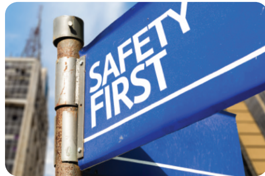
TAKE NO CHANCES – DO IT SAFE THE FIRST TIME.

Life and limb are not worth short-cuts. Going home safe at the end of the day is more important than saving a minute and detouring away from safe practices. Take no chances – do it safe the first time.