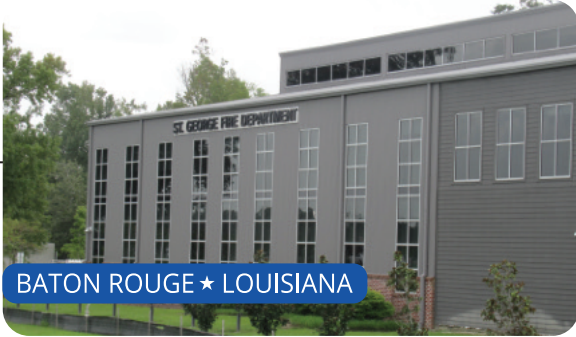
BATON ROUGE ★ LOUISIANA

Named after the neighborhood off Perkins Road, this department began as a volunteer unit transitioning in the 1990s to full time. The fire district now employs 178 people. This new construction is the largest project in their 50 year history. Guy Hopkins Construction is the general contractor for this facility that includes a new fire station, training and communications center, and a maintenance shop. Metro is installing a combination of VRF, conventional splits, and fan coil units fed from the existing chilled water system. This project is scheduled for completion in early 2021.