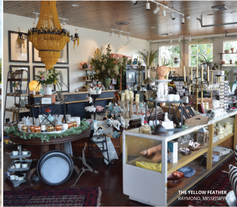
THE YELLOW FEATHER RAYMOND, MISSISSIPPI

Metro worked with the building owner to design and install new HVAC, ductwork, and controls. Exposed spiral duct was used in the large meeting space along with conventional splits and mini-splits for heating/cooling.