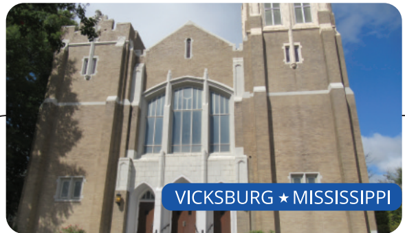
VICKSBURG ★ MISSISSIPPI

Dating back to pre-Civil War days, this historic church completed its first building in 1850. After a second building was completed in 1899, the church burned Palm Sunday, 1925. The congregation rallied, rebuilt the facility and even during the Great Depression and World War II were able to pay off the debt by 1945. Recent renovations included replacement of two boilers, air handlers, hot water coils, fin tube radiators, pumps, and controls. Metro was the prime contractor for this project completed in September.