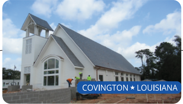
COVINGTON ★ LOUISIANA

Wedding bells will soon signal the "I dos" of new couples at First Baptist's wedding chapel. The 9,200 square foot new facility, built in the traditional style features a 55 foot bell tower, gardens, and chapel for the ceremony. Kent Design Build is the general contractor for this project that adjoins the main campus of the church. Metro installed a package unit and VRF for the HVAC system. The chapel will be ready for events this month.