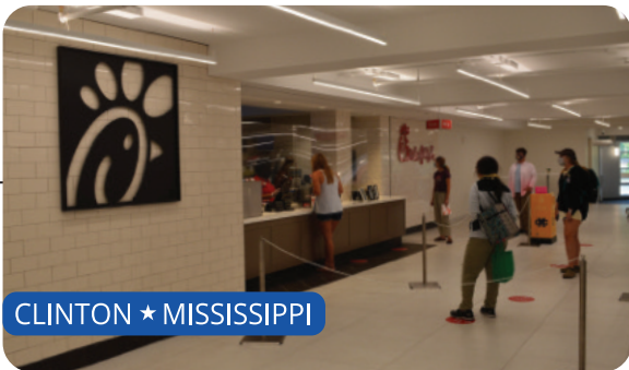
CLINTON ★ MISSISSIPPI

This new dining option opened on the Mississippi College campus August 18 just in time for the fall semester.