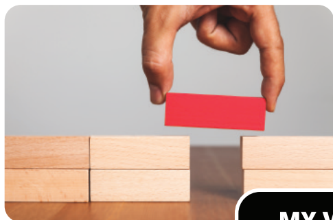
BY: RICK WHITE