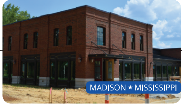
MADISON ★ MISSISSIPPI

If you have traveled the Gulf South, you have likely encountered Half Shell. This chain, started in 2009 in Gulfport, MS, is known for chargrilled oysters among other southern dishes. Now with 13 locations in 3 states, Madison will be the newest location opening this fall. Codaray Construction is the general contractor for this new development just east of I-55. Metro's work includes plumbing, HVAC, kitchen hoods and make up air systems.