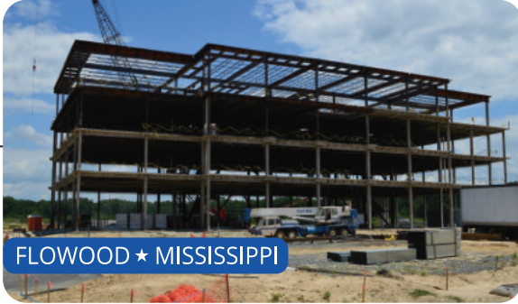
FLOWOOD ★ MISSISSIPPI

Community Bank has grown in a few short years from a small bank to a $3.3 billion enterprise with 51 offices spread over four states. New headquarters for this bank will be the flagship of the new 230 acre Waterton development in Flowood. This 90,000 square foot, 4-story building will front the central town square of this planned community. Fountain Construction is the general contractor for this project with Metro installing a ground source geothermal system for heating and cooling.