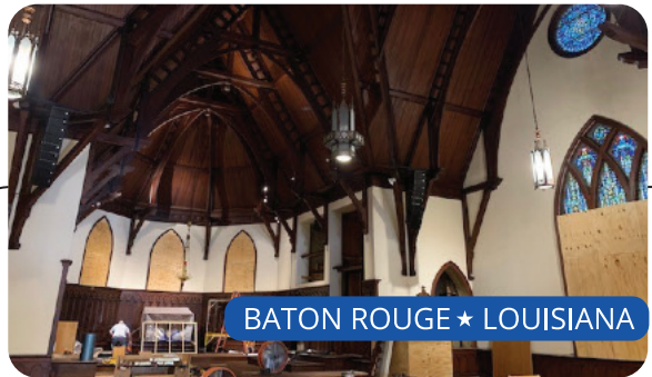
BATON ROUGE ★ LOUISIANA

Few church buildings have the rich history found in St. James Episcopal in Baton Rouge. The beginnings of St. James date back to 1819 with the formal charter in 1844. Built in the Gothic Revival style, the main sanctuary features original Tiffany glass hand-crafted by Louis Comfort Tiffany of Tiffany Glassworks in New York City. Cangelosi Ward is the general contractor for this extensive renovation of the church. Metro will remove existing boiler, air handlers, and piping and install new VRF systems for the facility. This project will be completed in early 2021.