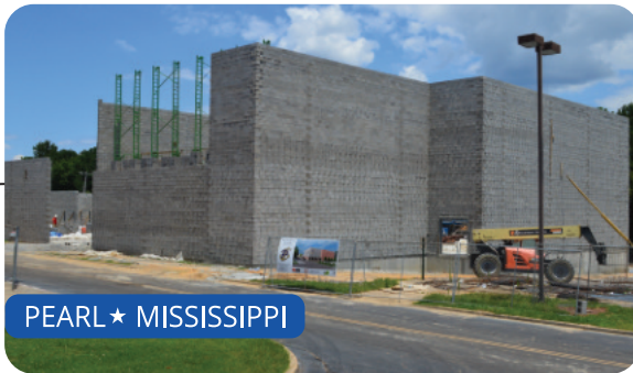
PEARL ★ MISSISSIPPI

The Pearl School District is adding a multi-purpose facility to the Pearl High School campus. This 21,000 square foot space includes a gymnasium, the drama department, and classrooms. Pearl High is one of six schools in the city system with over 4,000 students enrolled. S&L Construction is the general contractor for this addition. Metro's scope of work includes Roof-top HVAC, mini-splits and all plumbing for the new building.