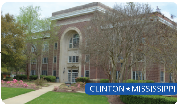
CLINTON ★ MISSISSIPPI

As Mississippi's oldest and largest private university in the state, MC was proud to receive the award of #1 private college in the state from the Wall Street Journal. Founded in 1826, the campus continues to grow and renovate space to accommodate more than 5,000 students. Copeland and Johns is the GC for renovations on Alumni Hall. Metro's scope includes plumbing improvements, changing out the AHUs, adding a 110-ton chiller, and related piping and duct. This improved space will include Chick-Fila and Einstein Brothers Bagels. Work is scheduled for completion by late summer.