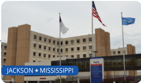
JACKSON ★ MISSISSIPPI

We are essentially complete with a mammoth air handler swap in this Jackson medical facility. This 62,500 cfm custom air handler had to be lowered via a crane down a shaft for reassembly and connections. Metro's work included setting up temporary air to supply the hospital, installing the air handler, electrical, and controls. We were the prime contractor working direct for Baptist.