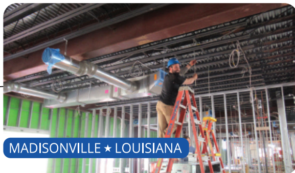
MADISONVILLE ★ LOUISIANA

This elementary school is part of the St. Tammany Parish School District with more than 1,000 students attending grades K-2. The district boasts 100% certified teachers in this school with superior ratings among public schools. Voelkel McWilliams is the GC for this project adding more than 50,000 square feet of new classroom space and a new gymnasium. Our scope of work includes a VRF system for the whole facility. This school will be ready for occupancy by the spring semester, 2021.