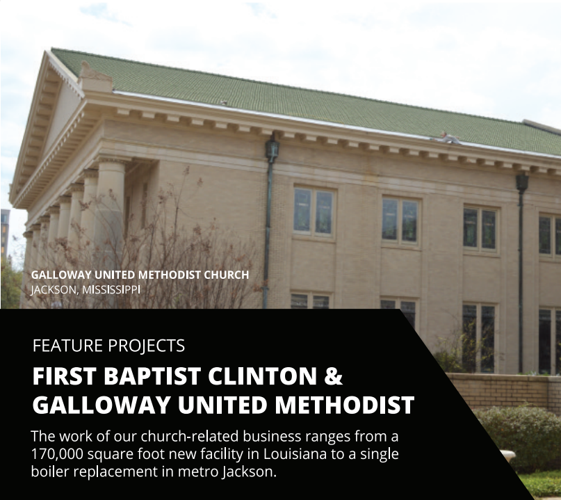
GALLOWAY UNITED METHODIST CHURCH JACKSON, MISSISSIPPI