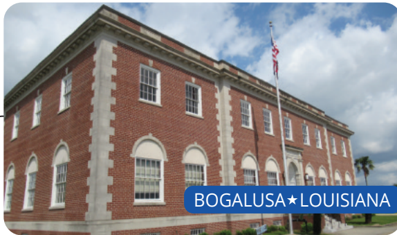
BOGALUSA ★ LOUISIANA

The old post office in Bogalusa is receiving all new mechanical equipment as part of a building renovation. This facility is Colonial Revival architecture built in 1930 and listed on the National Register of Historic Places.