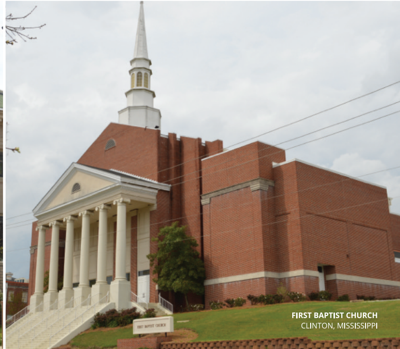
FIRST BAPTIST CHURCH CLINTON, MISSISSIPPI

The work of our church-related business ranges from a 170,000 square foot new facility in Louisiana to a single boiler replacement in metro Jackson.