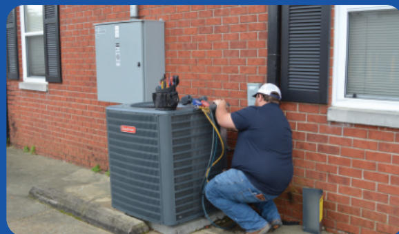
METRO BUILDING SERVICES

Metro Building Services crews are already experiencing the first days of summer as temps have soared into the mid 80s. Many preventive maintenance agreements have a spring/fall cycle for check-ups to assure minimum downtime as the 90-100 degree temps hit. Now is the perfect time to add planned maintenance to your facility. A plan today may prevent an emergency three months from now. Call our service line at 601-398-2475 to arrange for rapid response.