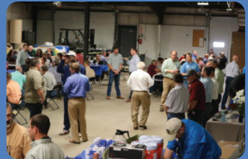
ANNUAL FISH FRY & OPEN HOUSE • APRIL 26, 2019

Thanks to the more than 400 guests who attended our largest ever Annual Fish Fry. The food was excellent and our hats are off to the leadership team who assisted with set-up, food prep and clean up. The weather was perfect for the event.