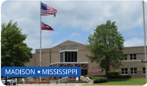
MADISON ★ MISSISSIPPI