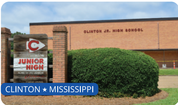
CLINTON ★ MISSISSIPPI

Clinton Public Schools was recognized by the MS Department of Education as an "A" School in recent rankings. As one of fifteen current school projects on the books at Metro, Clinton JHS has a hard deadline of August 1 for completion. Benson Builders is the general contractor for this renovation of about 135,000 square feet of classroom and administrative space. Our work includes 61 chilled water fan coil units, four roof-top units, one air handler, seven mini-splits, and related duct and ventilation.