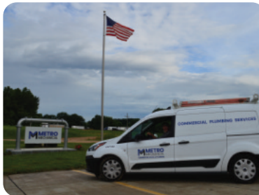
NEW METRO FUEL-SAVING VANS

These may be small changes, but they pay real and constant dividends. Our challenge is to be an advocate for energy efficiency. Setting a good example for the next generation is easy and relatively painless. It's also a choice. Commit to conserve and determine how you can help.