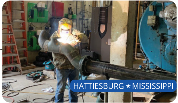
HATTIESBURG ★ MISSISSIPPI

Another prime mechanical project is the renovation of heating water and domestic water systems for the science building on the University of Southern MS campus. Since the building is occupied even for the summer break, we are staging our work to minimize disruption. Metro's work includes demo of the existing boilers and pumps. New equipment includes three 3.5 million BTU boilers, two domestic water heaters, and one steam boiler along with associated piping and pumps. This work will be complete late this month.