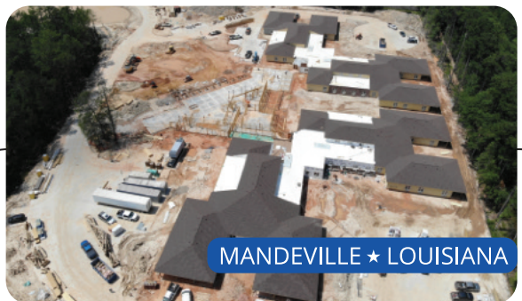
MANDEVILLE ★ LOUISIANA

Senior living communities continue growth in the south Louisiana market. Commcare is developing this 68,000 square foot senior living center that will house 100+ residents. Donahue-Favret Contractors is the general contractor for this facility scheduled for completion in late summer. Metro is installing all HVAC for this center and includes PTACs for resident rooms and package units for the common space and administrative areas.