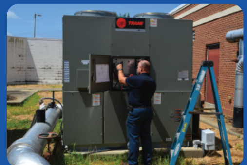
METRO BUILDING SERVICES 24X7

Our service line is manned with quality personnel 24 hours a day and we respond to every need. For planned equipment changes or the emergency need, call our main number at 601-398-2475. We are ready to serve!