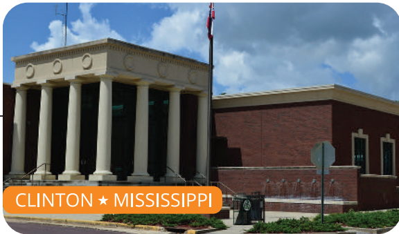
CLINTON ★ MISSISSIPPI

Metro is performing a 35-ton system change-out and EMS upgrade for the City of Clinton's Police Department. This is a prime mechanical project. The City has over two centuries of history being founded in 1805 as Mt. Salus. Almost becoming the capital of Mississippi (losing out to Jackson), it still has a Capitol Street today.