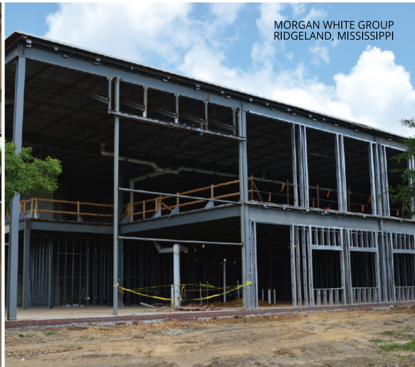
MORGAN WHITE GROUP RIDGELAND, MISSISSIPPI

Metro's work includes eight new roof top units, IT room cooling, 70 VAVs, energy management, and new plumbing for the total space.