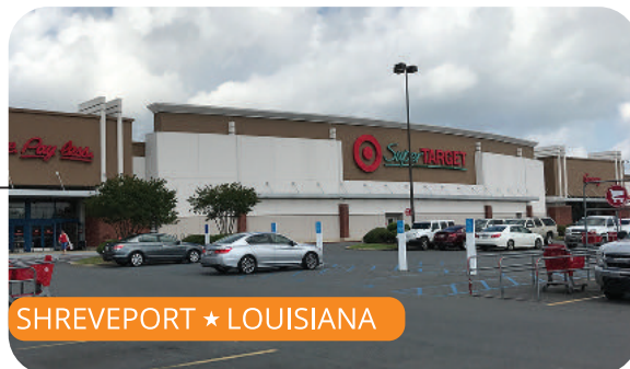
SHREVEPORT ★ LOUISIANA

Metro was the contractor on site in 2000 when the original construction was done on this 172,000 square foot retail store. Working with Stewart Perry of Birmingham, we are back in Shreveport for a store refresh. This is one of several Target renovations we have completed in recent years. Our work includes replacement of some of the roof-top HVAC and plumbing in the deli, bakery, and office space.