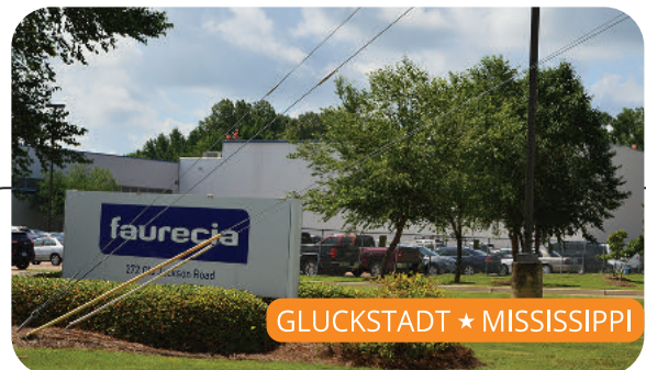
GLUCKSTADT ★ MISSISSIPPI

Faurecia is a division of Faurecia Worldwide, a major provider of automotive seating and interiors for many brands. This local plant employs approximately 250 but the company has over 20,000 working just in North America. JESCO is the general contractor for this warehouse addition and Metro is installing HVAC and a fire main for this expansion.