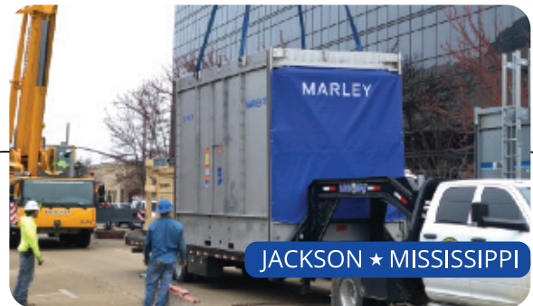
JACKSON ★ MISSISSIPPI

Another prime mechanical project completed early this year was a 365-ton cooling tower replacement for City Centre in downtown Jackson. This required a vertical lift of over 150 feet for this rooftop location of the cooling tower. This 12 story Class A office tower is managed by Hertz Investment Group. Metro's work included demo and removal of the old tower, adding a new pump and associated piping.