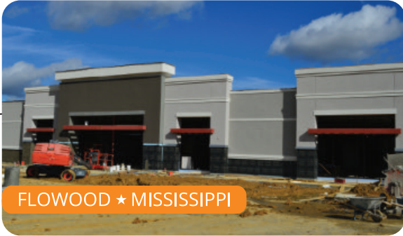
FLOWOOD ★ MISSISSIPPI

There are furniture stores and then there are furniture giants. The Ashley brand qualifies for the latter. In just 20 years, this family owned franchise has gone from zero to 750 stores and over 3 billion in sales worldwide. They were named #1 retailer of home furniture and the fastest growing furniture brand. Clark Construction of McComb is building this new 30,000 square foot facility in Flowood. Metro is installing the HVAC system which includes 13 Roof-top units. Ashley is scheduled for opening in early 2018.