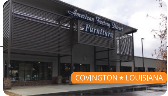
COVINGTON ★ LOUISIANA

With roots going back to 1937, the Comeaux family has a long history in furniture. They opened the American Factory Direct brand in 1996 with a location in Mandeville, Louisiana adding a Distribution Center in 2008. They have expanded the footprint to include stores in Long Beach, Mississippi and Baton Rouge. Kent Design Build was the general contractor for this new 37,000 square foot retail facility and Metro installed 11 roof-top units as part of this construction. American Factory Direct opened in December at this new site.