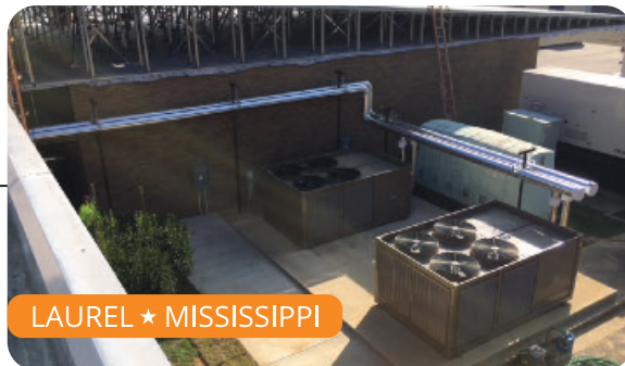
LAUREL ★ MISSISSIPPI

The service map of Dixie Electric Power covers most of Jones and Wayne Counties along with the eastern half of Forrest County and western Perry County. It is one of many electric cooperatives set up in the 1930s across the state to provide service to rural areas. Dixie now serves almost 40,000 meters with 5,000 miles of energized lines. Larry Sumrall Contractors of Laurel is the general contractor for a renovation on the Dixie offices. Metro is providing HVAC and plumbing for the customer service lobby and administrative areas. Our work includes the installation of two 50-ton chillers, re-working chilled water piping, and plumbing renovations for kitchen and restroom areas.