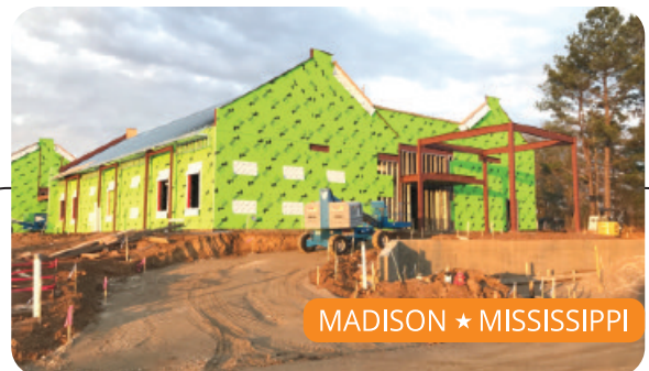
MADISON ★ MISSISSIPPI

MS Premier Plastic Surgery is adding a medical office location in Madison to complement their two surgical locations in Jackson. The term "plastic surgery" conjures up the vision of cosmetic fixes. This group offers a full array of cosmetic, reconstructive, and hand/wrist procedures. Probitry Contracting Group is the general contractor for this new medical office space and Metro is providing site utilities, plumbing, medical gas/equipment, and all HVAC for this facility scheduled for completion in late spring.