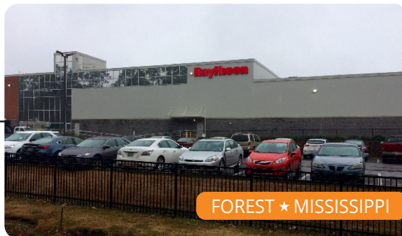
FOREST ★ MISSISSIPPI

Air conditioning and plumbing may be our mainstay, but our piping crews get exposure to a variety of work in industrial environments. An example is the Raytheon plant in Forest. Work included installation of two 100HP air compressors, dryers, air tanks, electrical service, and associated piping for the plant. Ingersoll Rand Industrial Technologies managed this change-out. The production setting required minimal downtime and our personnel completed ahead of schedule and within budget. Another specialty project for Metro!