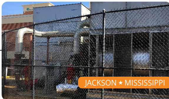
JACKSON ★ MISSISSIPPI

The off-season is the perfect time for mechanical renovations and equipment replacement for cooling systems. The Metro piping crew just completed the installation of two 1500 gpm cooling towers at Select Specialty. Metro's work also included structural steel, electrical, new pumps, and associated piping and insulation. This was a prime mechanical project for Metro Mechanical and finished in December.