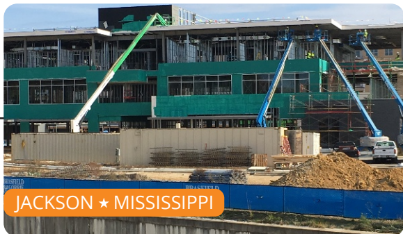
JACKSON ★ MISSISSIPPI

The District at Eastover continues a fast paced build-out with the addition of BankPlus as an anchor tenant for the 3 story office building fronting Interstate 55. This 67,000 sf building will feature restaurant and retail on the 1st floor with the bank occupying the rest of the space. BankPlus will offer real estate and commercial lending, private banking and other services. Metro's work includes all plumbing for the building as well as a combination of VRF/VAV systems and controls. Brasfield and Gorrie is the General Contractor for this project.