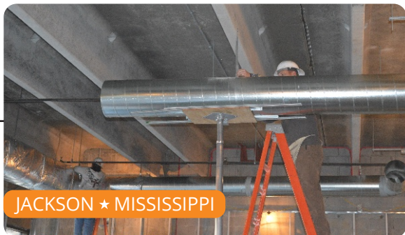
JACKSON ★ MISSISSIPPI

Another recent prime mechanical renovation with Mississippi Baptist Medical Center is the Manship Banquet facility. We are changing out the old HVAC and installing a VRF system, ERV, exhaust, and controls as well as new plumbing and fixtures. This renovation is typical of most Metro projects for 2016. Statistically, 90% of our work is a combination of building renovations, equipment upgrades or system changes for energy efficiency. Our management team can assist with design, construction and service for every mechanical need.